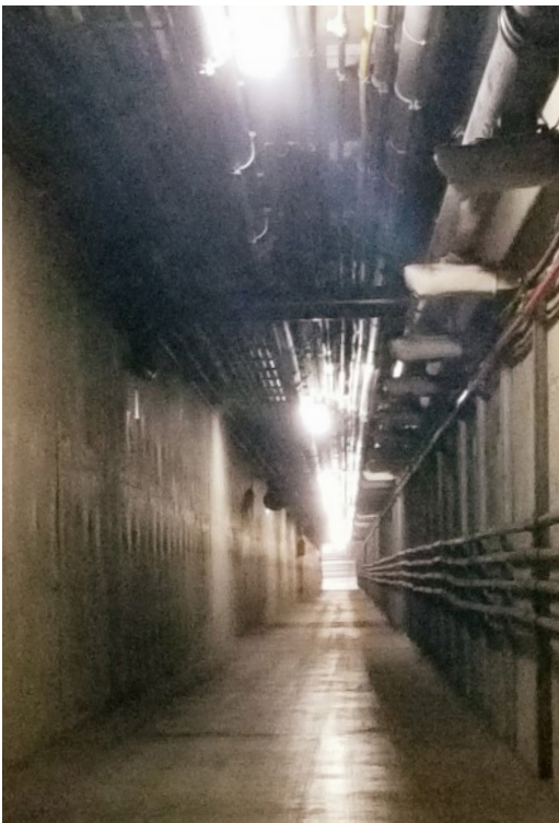
4-foot, 2-lamp, 32-Watt Fluorescent (Before)

The versatility of the WSE201 series allows the fixture to be installed in Parking Structures, Corridors, Stairwells, and Tunnels. The fixture has the option for wet location, as well as with tamper proof screws for added security.