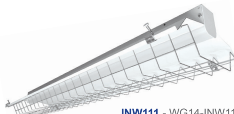
INW111 - WG14-INW111-4

* Wire guard included with luminaire. No part number required.