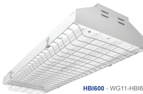
HBI600 - WG11-HBI600-4