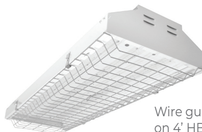
Wire guard installed on 4' HBI600/609

Los Angeles Lighting Mfg. Co. assumes no responsibility for claims arising out of improper or careless handling or installation of this product.