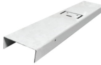
CMC-STW100 Chain Mount Coupling