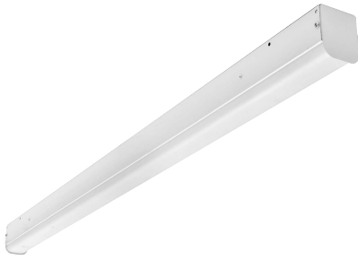
STW100 LED Strip Luminaire